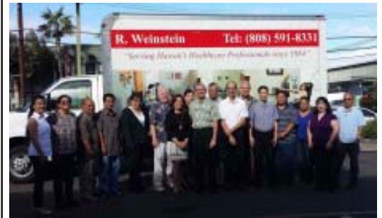
R. Weinstein Sales & Service Team

2017 is off to a quick start and the days seem to go by faster every day. The Doctors' Superstore is your one-stop source for all of your pharmaceutical, vaccine, point-of-care tests, supplies, disposables and medical equipment needs from the leading manufacturers. If you have patients that received their initial dose of Hepatitis A vaccine, now is the time to contact them to schedule their second dose to complete their series. Weinstein Pharmacy also has plenty of Hepatitis A vaccine on hand as well as a comprehensive inventory of travel and all other vaccines.